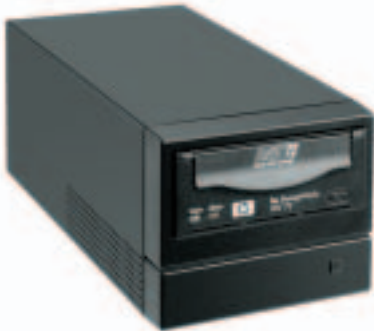
hp StorageWorks DAT 72 tape drive